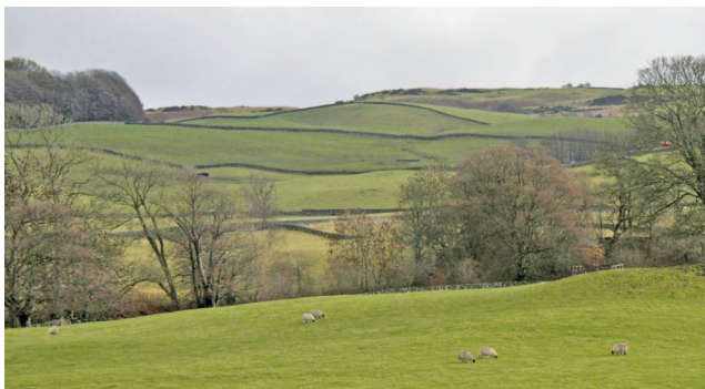
Figure 8. Pastoral view from the front of Glenlair.