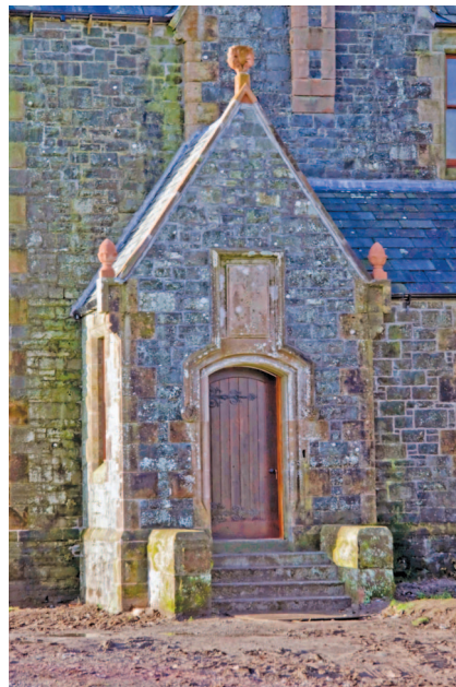
Figure 4. The side foyer has been almost completely restored.

In fact, Maxwell even did considerable research in color blindness. One approach he took was to peer into the eyes of dogs (he loved animals and had a special skill in working with them) and people (who might have been more difficult!) using a homemade ophthalmoscope to explore the causes of color blindness. He also made the world's first color photograph using three negatives with three filters and projected with three projectors. The original negatives, along with many other Maxwell artifacts, are on display