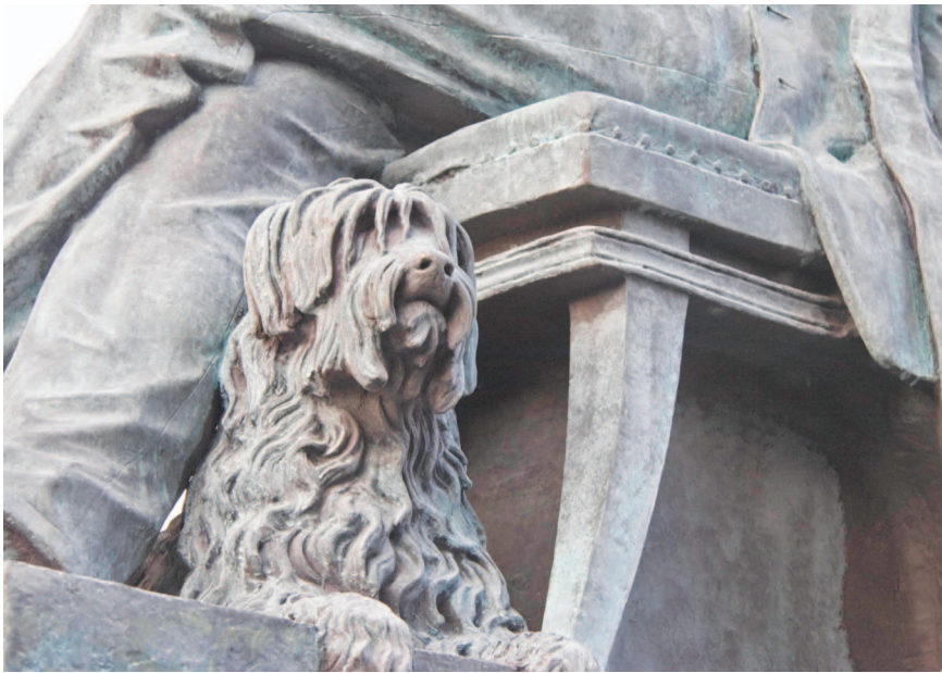
Figure 13. Maxwell's faithful dog at his feet. Note the missing rivets in the chair cushion above the dog's head.

The red light portion of the rainbow is allowed to pass through a small window and into the second prism. Only red light emerges from the second prism. This showed Newton (who is pointing at the ground) that the rainbow of colors is not generated by the prism; rather light is intrinsically composed of these colors and the prism merely separates the colors. To the right, the goddess of red light, Eos