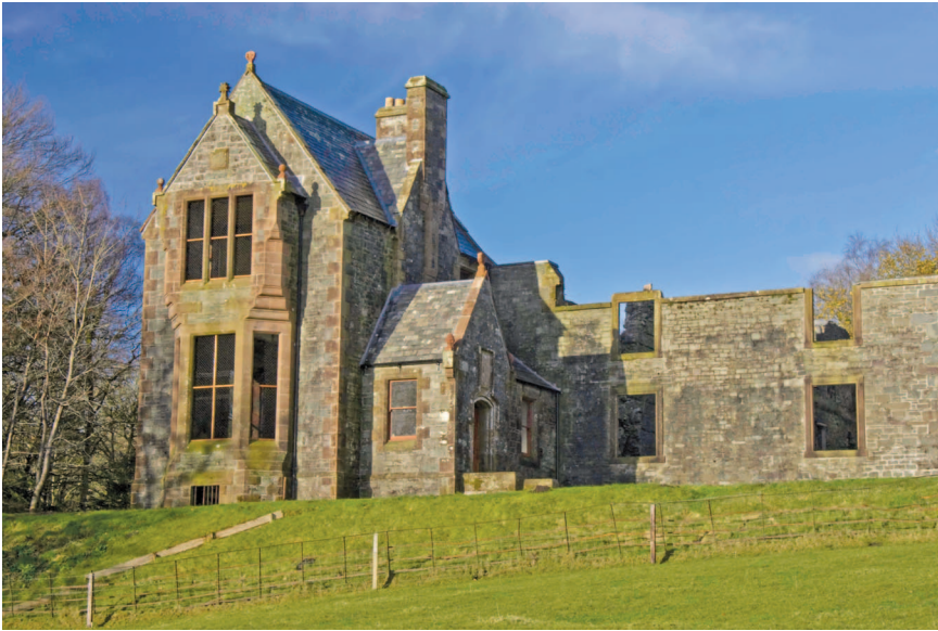
Figure 3. Glenlair nearing the completion of our preservation efforts, November 2008.

floor (Figure 5). The tile floor might have been designed by Maxwell himself. When I first saw the floor in 2005, there was a considerable amount of debris. All I could see was tiles of white, red, green, and blue. With the floor now clean and clear, it turns out there are also two shades of brown, and the red (perhaps with age?) could also be called brown.